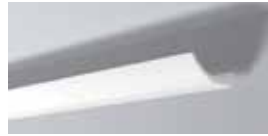
WT4 H 70 mm W 180 mm