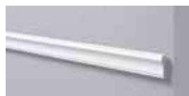
WL6 H 75 mm W 20 mm