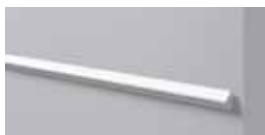
WL1 H 40 mm W 20 mm