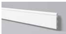
FL4 H 150 mm W 20 mm