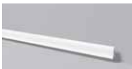
FL3 H 55 mm W 17 mm