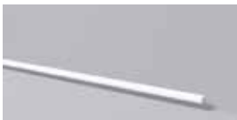
FL6 H 19 mm W 12 mm