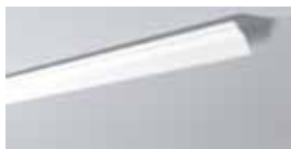
WT26 H 75 mm W 75 mm