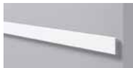
WD2 H 70 mm W 15 mm