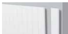
WG1 H 10 mm W 79 mm