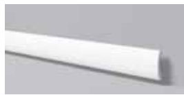
FD3 H 100 mm W 20 mm