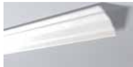
WT24 H 150 mm W 150 mm