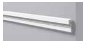
WL4 H 100 mm W 40 mm