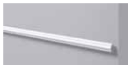
WL3 H 40 mm W 15 mm