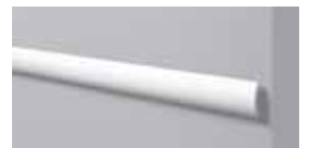
WD3 H 70 mm W 15 mm