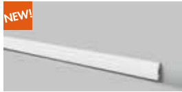
FB1 H 60 mm W 13 mm