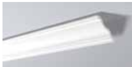
WT11 H 130 mm W 105 mm