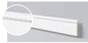
FO2 H 120 mm W 15 mm