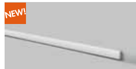
FT1 H 38 mm W 13 mm