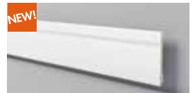
FD20 H 200 mm W 18 mm