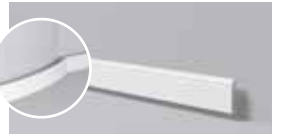
FL1 +flex H 80 mm W 12 mm