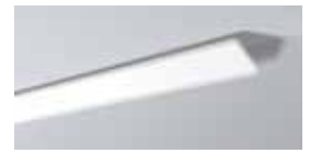
WT2 H 75 mm W 90 mm