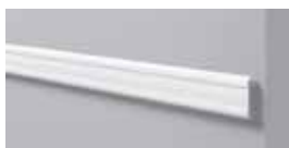
WL5 H 85 mm W 15 mm