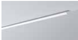
WT7 H 16 mm W 22 mm