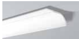
WT22 H 100 mm W 225 mm