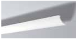
WT3 H 80 mm W 110 mm