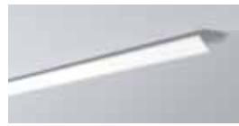
WT1 H 45 mm W 60 mm