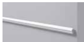
WL2 H 40 mm W 20 mm