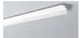
WT25 H 80 mm W 80 mm