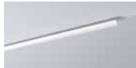
WT8 H 30 mm W 20 mm