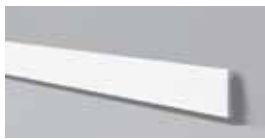
FD2 H 110 mm W 15 mm