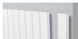
WG2 H 15 mm W 92,5 mm