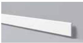
FD1 H 100 mm W 15 mm