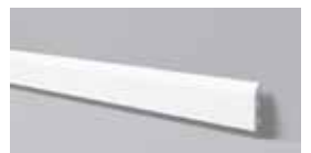
FL5 H 100 mm W 20 mm