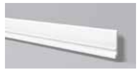
FD21 H 130 mm W 20 mm