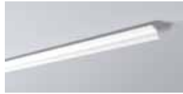
WT5 H 50 mm W 50 mm