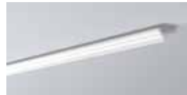
WT9 H 50 mm W 40 mm