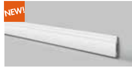
FB2 H 100 mm W 13 mm