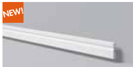
FD7 H 70 mm W 18 mm